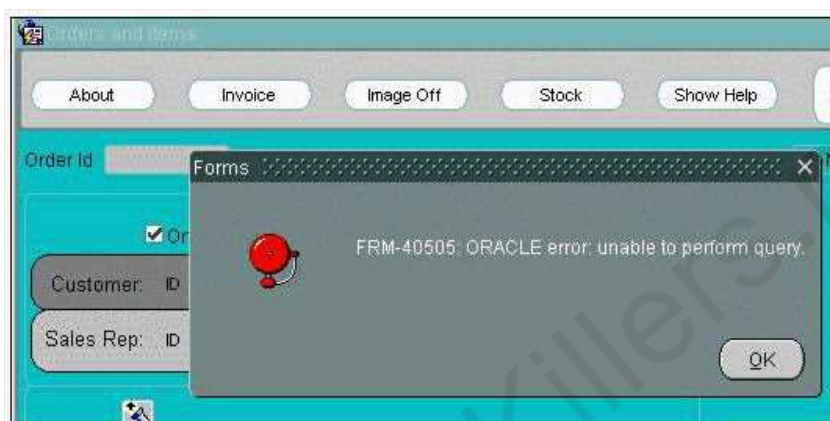
Exhibit: You are developing an Order Entry form. The When-New-Form-Instance trigger executes a query on the only block in the form. Instead of the alert shown in the exhibit, when the query cannot be performed you want to display to the user a message with the actual database error that is received.